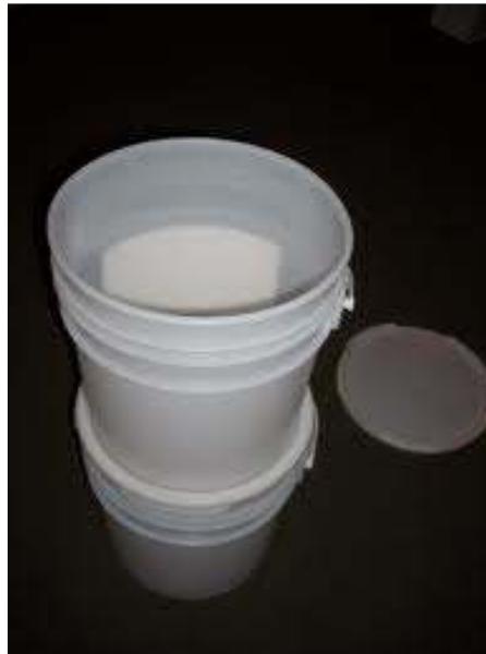
Figure 4 2x 5 gallons bucket