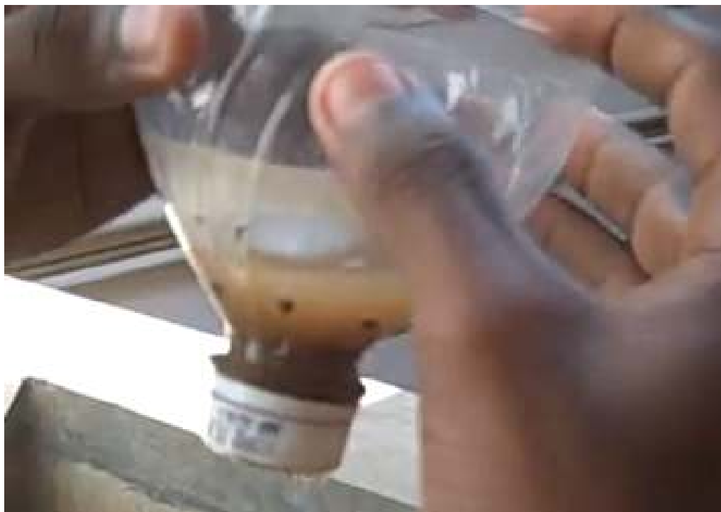
Figure 2 Top of the bottle - drilled

First of all you need to take your bottle and cut the top off. Now you must drill some holes through the top that you cut and through the cap.