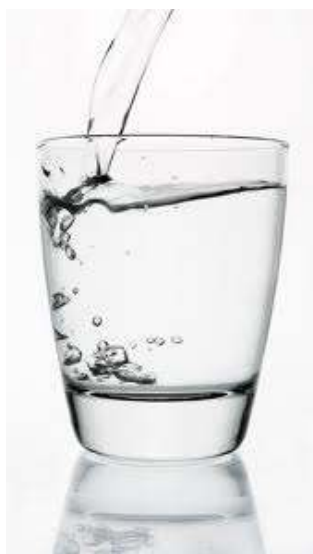
Figure 1 Glass of clear water

Very few people know, but you can use it as a back-up source of water in a crisis.