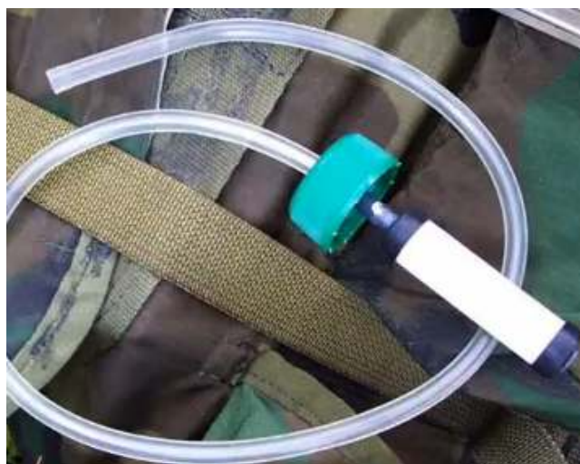
Figure 5 Plastic tubing with ceramic aquarium air stone

After that, just cut the bottom of the bottle to have a place where the water is poured. You close the soda bottle with the cap; let the ceramic air stone inside the cut bottle. The plastic tubing must be outside the bottle so you can drip water in another bottle, or glass.