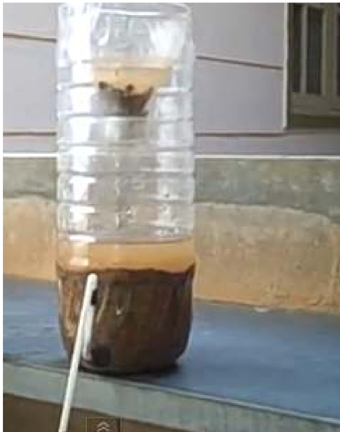
Figure 3 The pipe straw

Before you put the sand in the bottle, you must wash it for 15-20 times, and make a hole at the bottom of the bottle to put the straw pipe in there.