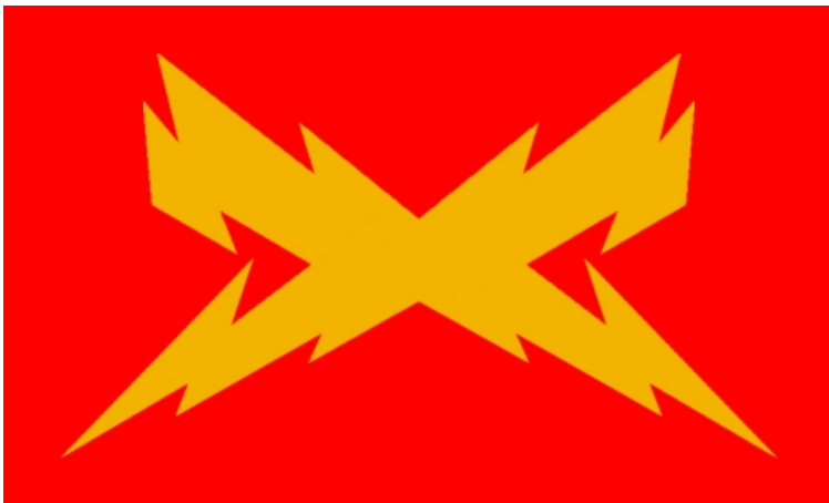
Battle Ensign of the Second Horseman, El Aku ALIHA ASUR HIGH

135. There was an instant silence in the gathering as recognition of The Most High came to be.